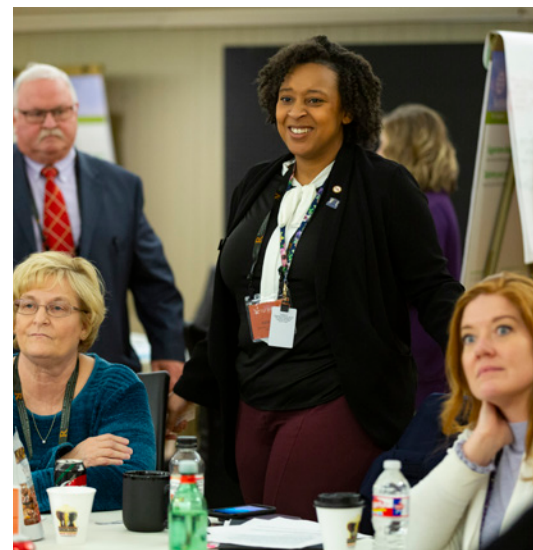
Halfway There: Working Group Progress